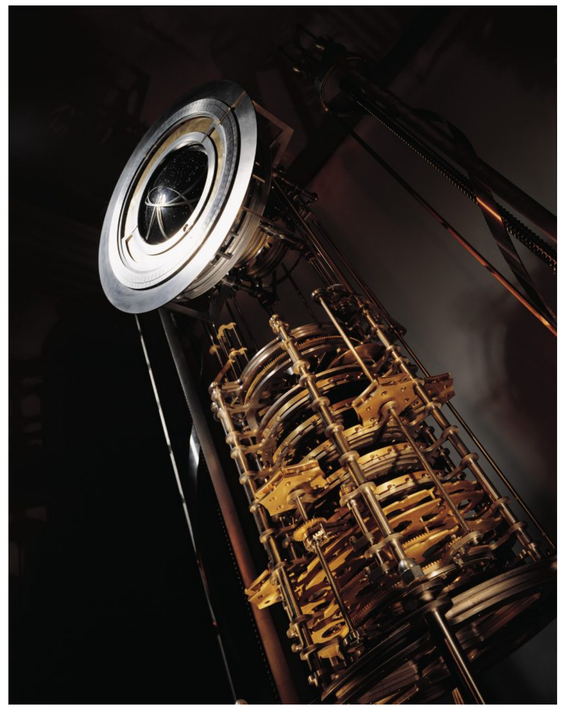
The 1999 prototype of the Long Now Clock

The first was a 2.5-metre-high prototype, finished in the nick of time on New Year's Eve 1999 to usher in the new millennium by chiming twice in front of a small crowd at San Francisco's Presidio neighbourhood. The clock now resides at the London