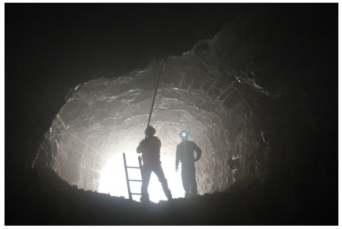
Construction of the Long Now Clock

A pitch-black airlock-style access passage opens into a 60metre upcast. Climbing a spiral staircase carved by robot out of the rock, you reach the clock's counterweights — a huge stack of stone disks, about the size of a small car, and twice as heavy at 4,500kg. To wind it, at least two people are needed to turn the capstan and raise the stones.