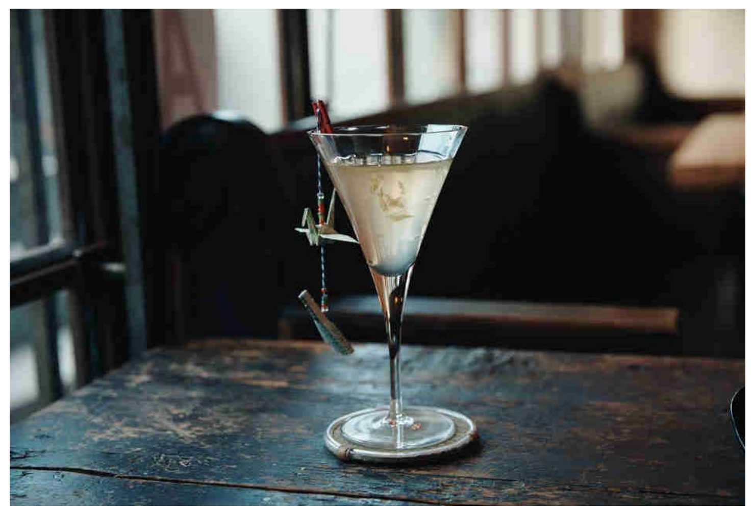
ROKC NEW YORK COCKTAIL | ZENITH RICHAF