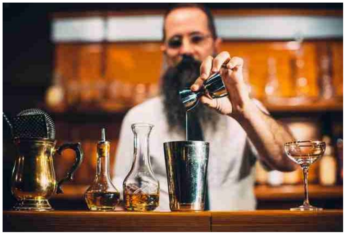
MILK ROOM CHICA