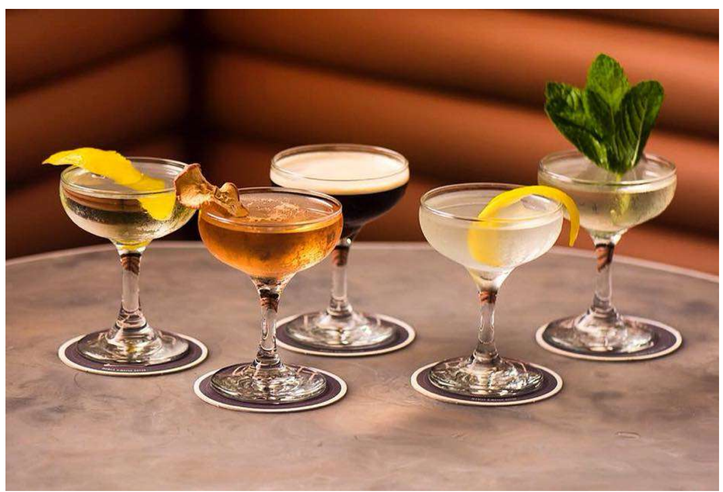
BIBO FRGO S