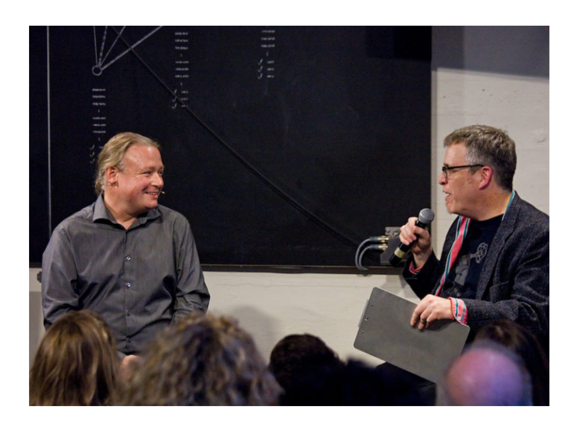
tl : the diamond industry would want to adopt that.

paper certificates, insuring a history of fraud and missing paperwork. Now, everybody in the chain - from the miner to the distributor, transporter, jeweler, retailer, and customer - has access to a shared ledger containing metadata: "the data about the diamond, its shape, its color, its size," or even a serial number. The ledger shows an immutable, incorruptible history, andit's no surprise