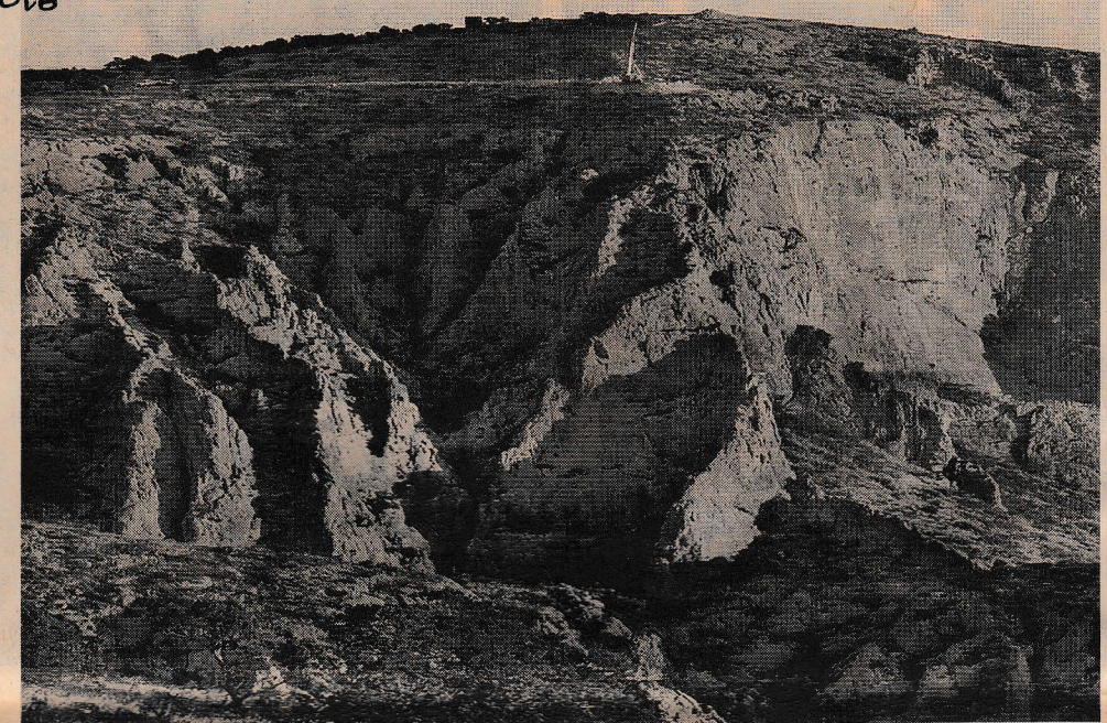
The mountain site for the 10,000-year clock in Texas - Long Now Foundation

change our idea of 'now'. By Leslie Hook