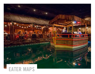
12 Great San Francisco Hotel Restaurants