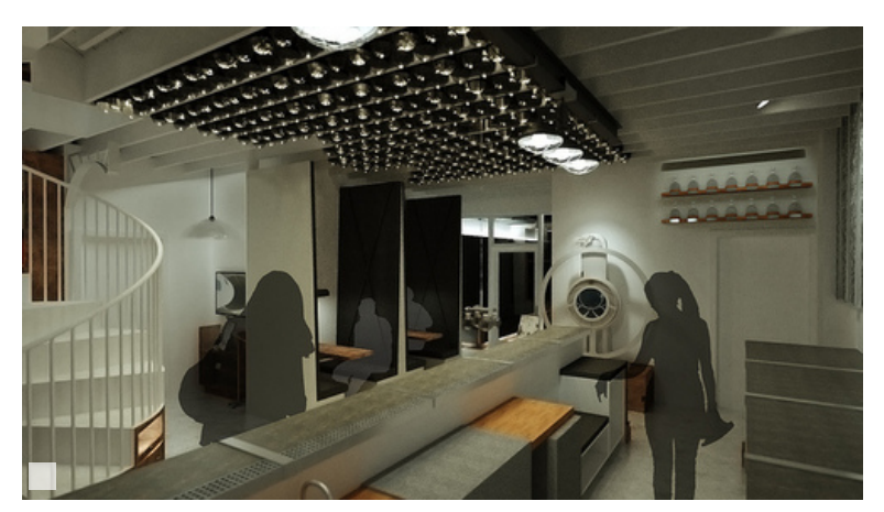
Rendering \ of \ the \ proposed \ salon. \

If all goes according to plan, a rather unusual bar and coffeehouse will be headed to Fort Mason later this year. The Long Now Salon is a new project from the folks behind the Long Now Foundation, who've had an office and gallery space at Fort Mason for many years. The foundation is intended to help people think more critically about humanity's long-term future through the building of a clock (currently underway in Texas) and library/archive that will last for the next 10,000 years. Now, they're hoping to add a cafe component to the project, with artisan tea and coffee during the day (to complement lectures and other events) and cocktails in the evening. The foundation's office is already closed and construction is underway; they're turning to crowdfunding for a final push.