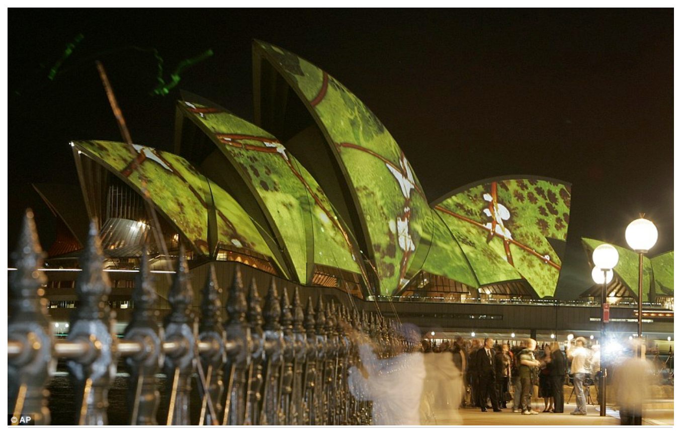
Star attraction: The event is expected to draw thousands of visitors as part of the Luminous festival which runs for three weeks