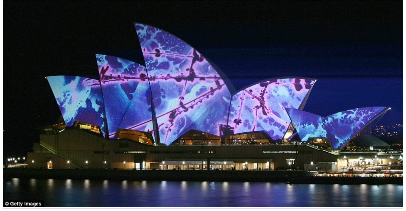
Spectacular: Sydney Opera House is lit up by a stunning array of ever-changing colours and patterns

He told the BBC he wanted people to 'surrender to another kind of world,' as they watched the transformations.