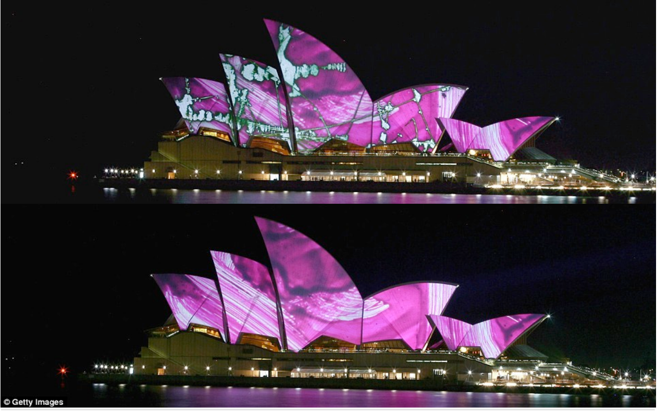
Iconic: The distinctive opera house appears almost unrecognisable as it flushes brilliant pink

There is also a soundtrack to accompany the light show.