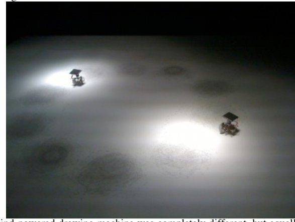
The wind-powered drawing machine was completely different, but equally

The light-powered one, Phototropic Drawing Device by David Bowen, featured two small robots with charcoal on their feet waddling and hopping around a large sheet of paper. They would change their direction depending on which lights were on, and they looked like two mini moon rovers searching for something