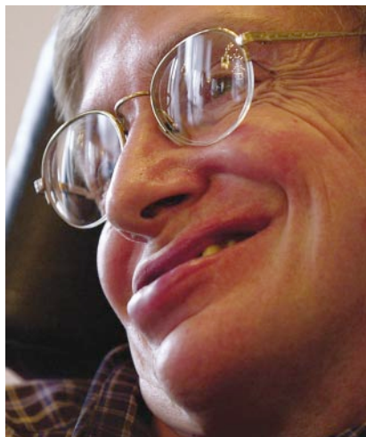
Brief wagers on time: Stephen Hawking is keen to bet on unanswered questions in physics.

Wallace measured the canal’s curvature using two markers, separated by about five kilometres and suspended at equal heights above the water’s surface. Viewed through a telescope mounted at the same height some 10 km away from the farthest marker, the nearest