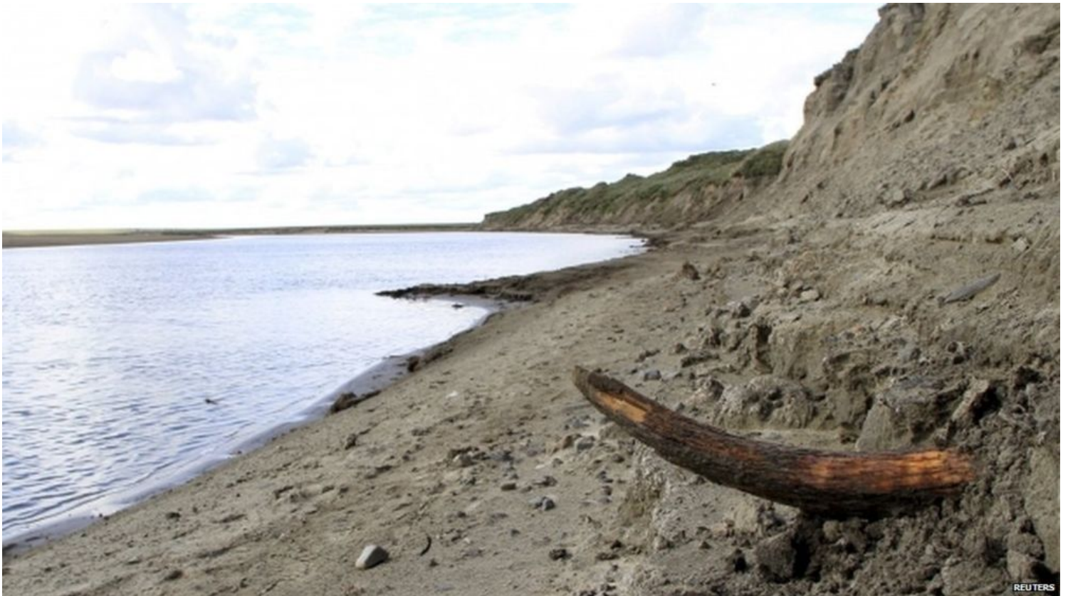
Image caption A mammoth tusk pictured by a river on the Taimyr Peninsula in Siberia

Since the late 1980s, Russian scientist Sergey Nimov has been reintroducing animals such as reindeer, horses and moose to chilly Siberia - so they can graze on the vegetation.