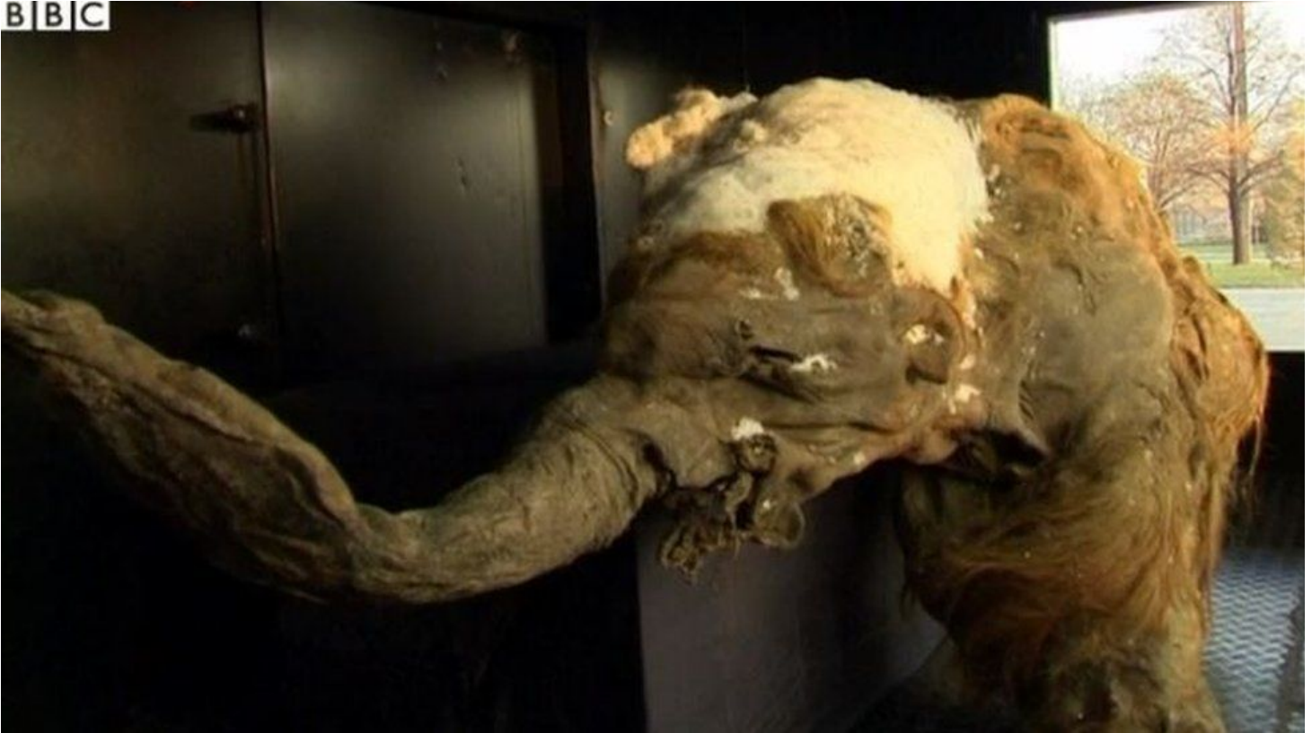
Image caption A 39,000-year-old baby Mammoth named Yuka on display in central Moscow

Prof Shapiro explains: "Once an animal dies, the DNA within every cell starts to break down straight away."