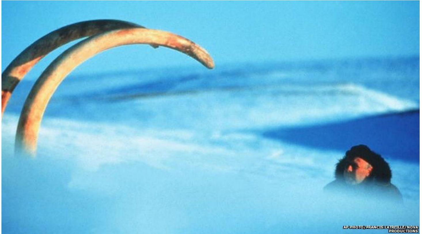
Image caption Siberian explorer Bernard Buigues, views the tusks of what is believed to be a 23,000-year-old woolly mammoth whose body is preserved in the ice in the Taimyr Peninsula, Siberia.

So why would anyone want to bring back mammoths?