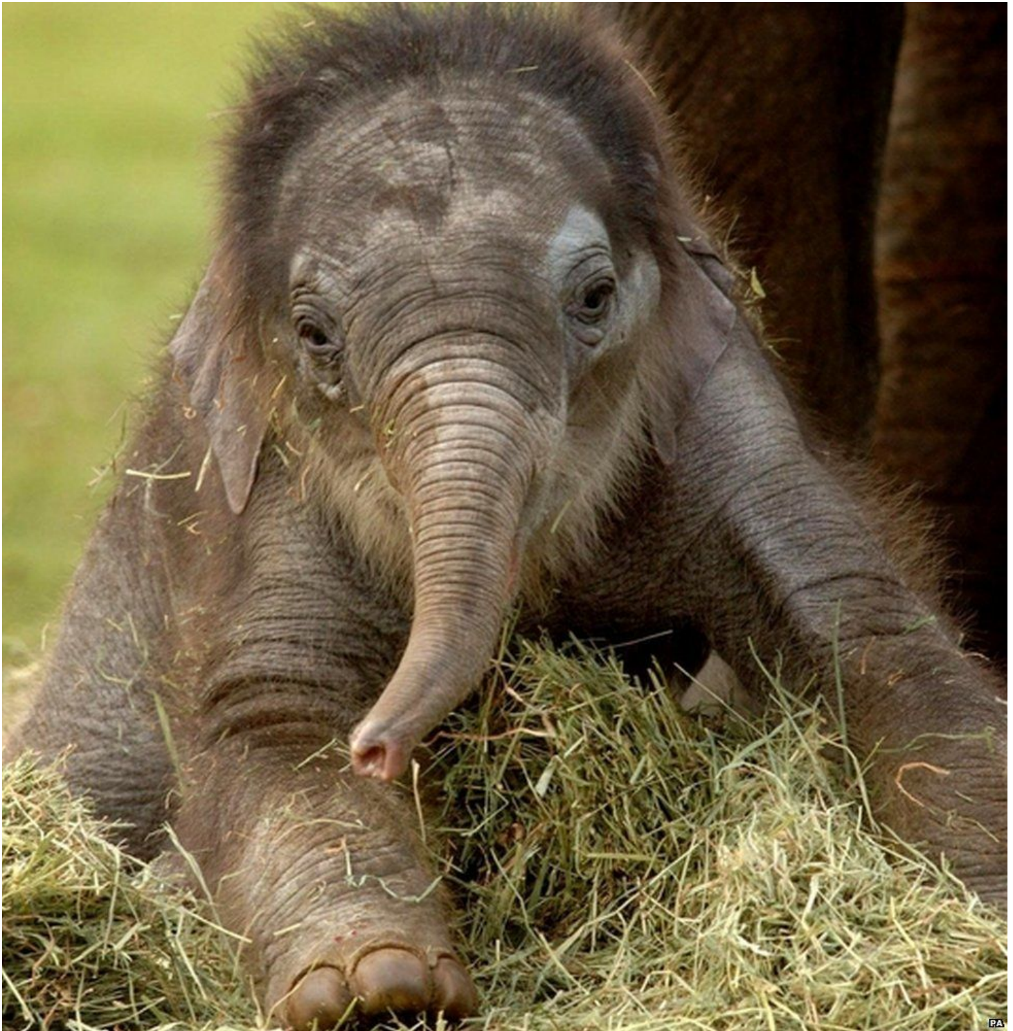
Image caption The Asian elephant, a relative of the mammoth

This creates a living cell that would be an elephant cell, but with mammoth inserts. What scientists are creating is a completely new animal. A hybrid mammoth-elephant.