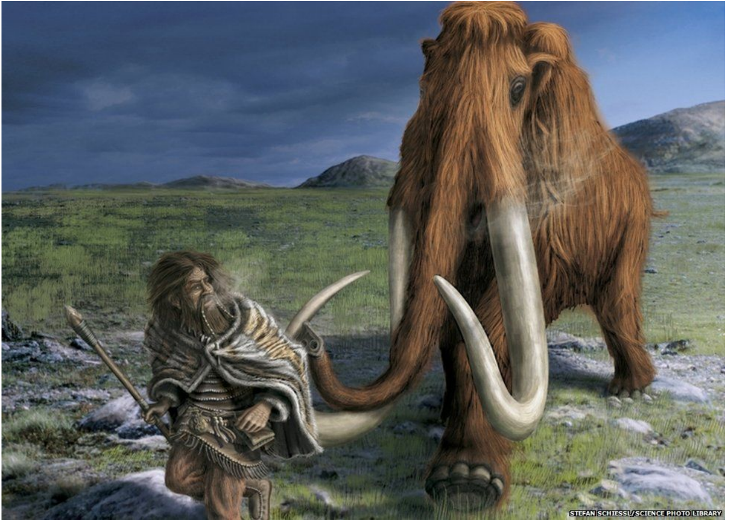
Image caption Mammoths used to roam in Norfolk, meaning your Big Weekend party might have looked a bit like this 14,000 years ago.

"For the past 200,000 years human beings have played an active role in causing extinction, changing the planet in an ignorant, blind way. Now we can play an active role in evolution.